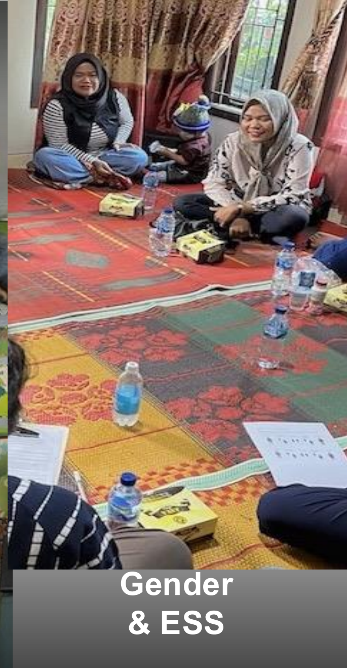
Gender & ESS